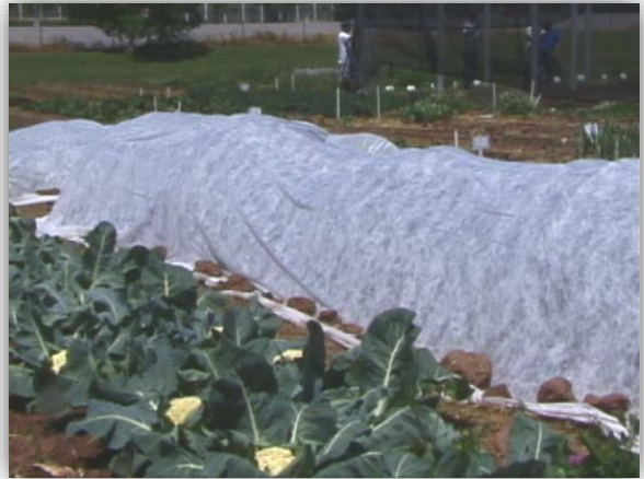
Figure 2. Floating row cover on broccoli and cabbage, protecting crops from cabbageworms moths.

Floating row covers are popular in commercial vegetable production where crops planted in large blocks are easily covered with row covers. Many brands and fabric types are commercially available.