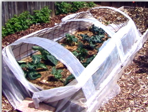
Figure 3. Cold frame for a raised bed garden made from concrete reinforcing mesh covered with 4-mil plastic. Notice the belt-like plastic straps, which hold the covering in place. The covering is slid between the straps and mesh to open and close. Pictured open for ventilation on a warm day.

The frame is concrete reinforcing mesh, available at hardware and lumber stores. This stiff wire mesh typically comes five feet wide, in 50 and 100-foot rolls. A six-foot length is required to make a Quonset-type frame over a four-foot wide growing bed. In trials, the low and spreading shape was ideal for trapping heat from the soil during a frosty night.