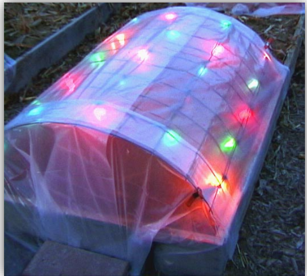
Figure 7. Cold frame with Christmas tree lights for additional warmth.

Space blanket with Christmas tree lights – For the gardener really wanting to extend the growing season, try Christmas lights plus a space blanket. One 25 light string of C-7 (mid-size) Christmas lights per frame unit (four feet wide by five feet long) with a space blanket on top gave 18°F to over 30°F frost protection in Fort Collins trials.