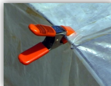
Figure 4. Clip holds plastic on frame.

Hold the plastic onto the frame with small clips available at local hardware stores. Clothespins do not hold in the wind. Another method is to use a series of 6-inch wide, belt-like plastic straps arching over the frame (above the plastic cover) and stapled onto the box. Open and close the cover by sliding it between the frame and the belt-like straps. Hold the plastic closed at the ends with a rock or brick. [Figure 4]