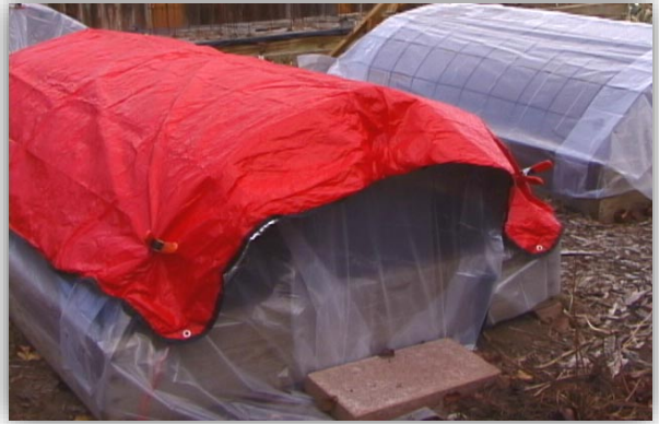
Figure 6. Aluminum space blanket covering a cold frame for extra protection on cold nights.