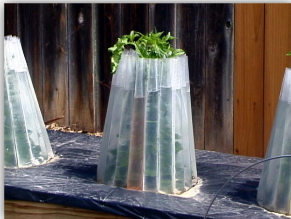
Figure 8. Tomato in Wall-of-Water. Notice use of black plastic mulch to warm the soil, another limiting factor of early production. Also, note the plant has grown beyond the device and is now less protected from frost.

Authors: David Whiting (CSU Extension, retired), with Carol O'Meara (CSU Extension, Boulder County), and Carl Wilson (CSU Extension, retired).