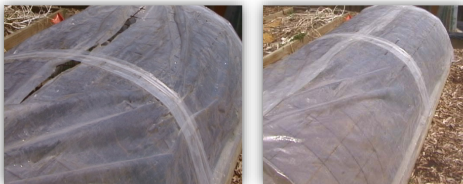
Figure 5. Left: Cover must be opened at least a slit to prevent over-heating. Right: Cold frame pictured closed for a cold night.

On cool days, open the top a crack to prevent excessive heat build-up. On a warm day, the plastic can be slid down the side, ventilating and providing crops exposure to the outdoors. On freezing nights, close the cover completely. On warm nights, the covers may be left open a crack. On stormy days with full cloud cover and no direct sun, the cover may remain closed. [Figure 5]