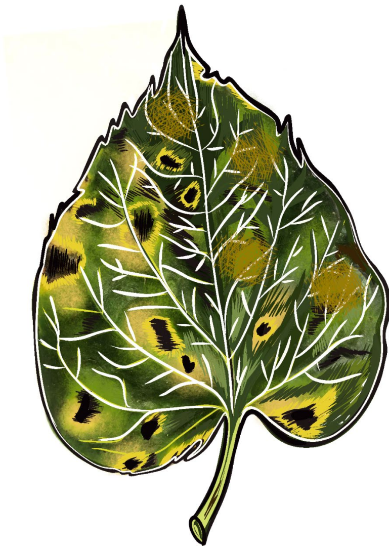
Bean Leaf with Necrotic Spots Artwork by Melissa Schreiner © 2023