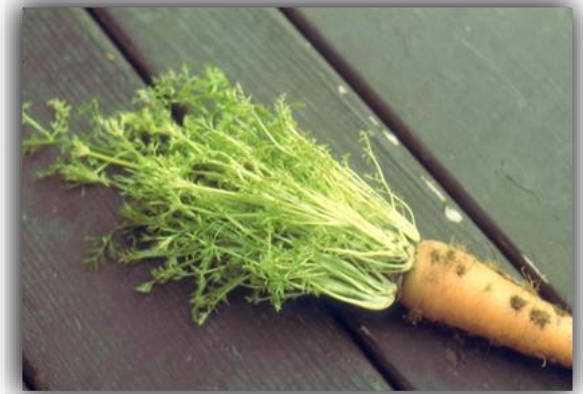
Figure 7. Aster yellows on carrot.

Although aster leafhoppers spread the disease, placing infected plants in the yard can also spread it. Management strategies for aster yellows include planting healthy plants, controlling weeds that may harbor the insects, and removing infected plants. Even though only one part of a plant appears infected, one must assume the phytoplasma is throughout the entire plant.