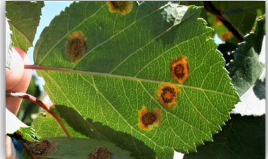
Figure 2. Cedar knot gall rust is a common leaf spot with a colorful border.

Fungal fruiting structures (reproductive structures) are usually embedded in the dead interior. Frequently, a halo of yellow or red color develops around the border. A halo indicates recently killed tissue that will eventually die. Because of the cycle of killing tissue and creating a border, then killing more tissue and creating another border, many fungal leaf spots take on a target-like appearance.