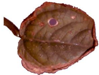
Figure 13. Salt damage on bean leaf burns the margin of the leaf. This was caused by using compost high in salts.

Compost and other soil amendments can be high in salt when made with manure or biosolids. Symptoms of salt burn include marginal burning of leaves, stunting, root dieback, and death of plants. For additional information, refer to CMG GardenNotes #241, Soil Amendments .