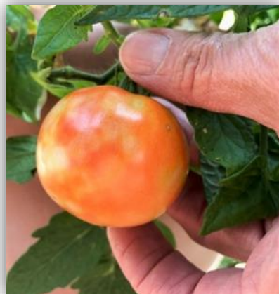
Figure 6. Tomato spotted wilt virus on tomato fruit.

For example, common virus diseases in Colorado include curly top virus of tomatoes, cucumber mosaic virus of vine crops and tomatoes, tomato spotted wilt virus of tomato, and a variety of greenhouse plant viruses.