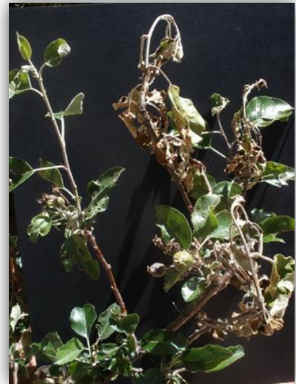
Figure 5. Fireblight on crabapple.

Viruses are crystalline particles composed of nucleic acid (ribonucleic acid or deoxyribonucleic acid) and protein. They are obligate parasites, meaning they are unable to survive outside of their host. Small virus particles can be found in all plant parts and cannot be seen without an electron microscope.