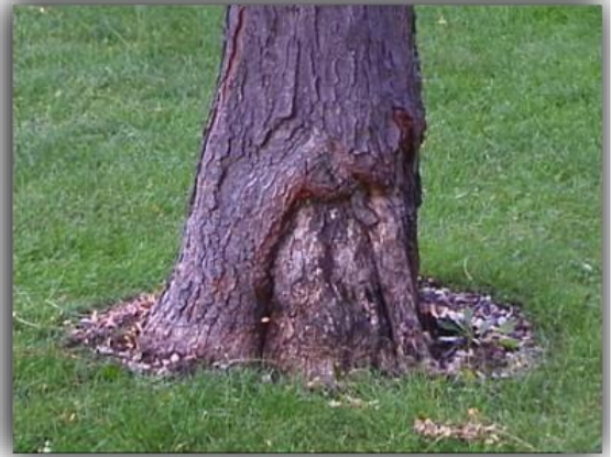
Figure 4. Canker at the base of honeylocust.

Common fungal cankers in Colorado are Cytospora ( Cytospora sp.) and Thyronectria ( Thyronectria sp.). A common bacterial disease which causes cankers in Colorado is fireblight ( Erwinia amylovora ).