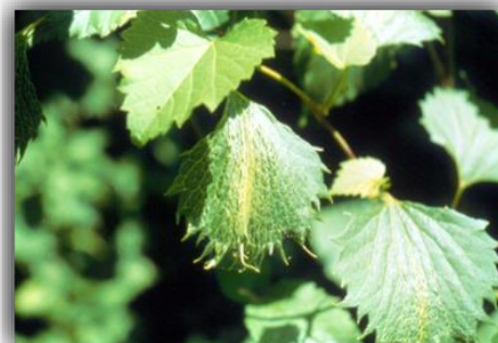
Figure 12. Damage on grapes from 2,4-D. Notice the distortion in leaf vein pattern.

Excessive concentrations of these chemicals cause twisting and curling of stems, stem swelling, weakened cell walls, rapid cell growth, and cellular and vascular damage and death. Grasses are not affected by plant growth regulators apparently due to a different arrangement of vascular bundles (xylem and phloem).