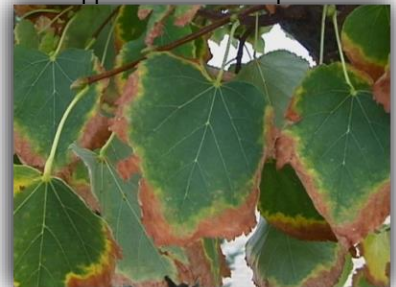
Figure 9. Leaf scorch on linden caused by hardscaping over the root zone.