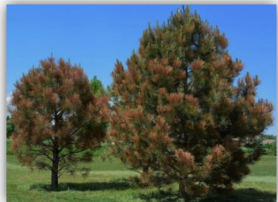
Figure 10. Winter dehydration on pine appears on needle tips.