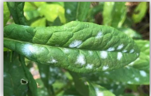
Figure 3. Powdery Mildew.

There are many species of mildew fungi, each being host specific. In Colorado, for example, it is common on ash, lilac, grapes, roses, turfgrass, vine crops (cucumbers, melons, and squash), peas, euonymus, cherry, apple, crabapple, pear, Virginia creeper, and others.