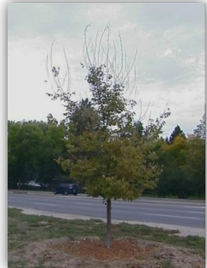
Figure 8. Water stress on trees often appears from the top down.

Oxygen starvation occurs when excess water in the soil drives out oxygen, causing the suffocation of roots. Plants respond by dropping lower leaves that are usually yellowed or necrotic. Leaf loss is most noticeable from the inside of the plant out and the bottom up. In addition, leaves may be