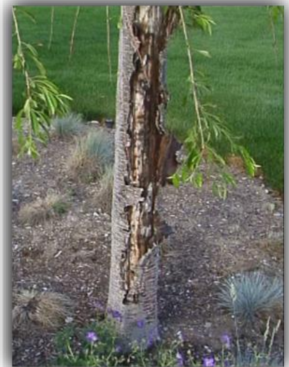
Figure 11. Sunscald or southwest bark injury results from rapid winter temperature changes.

Spring freezes damage exterior buds first, as these are the first to de-harden. Fall freezes affect interior buds first as these are the last to harden. Damage to tissues is uniform. For example, newly developing conifer needles may be killed completely or from the tips inward.