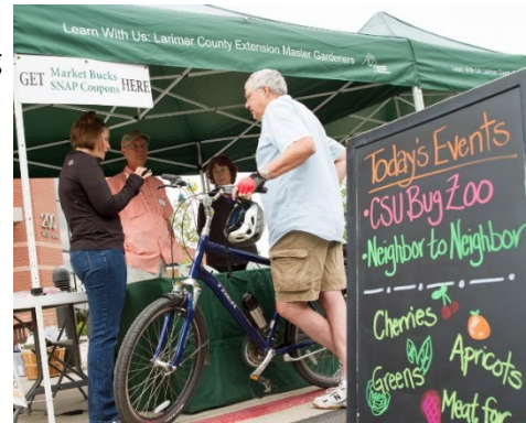
Farmers Market Booth in Larimer County

Audience Colorado Master Gardeners assist Colorado State University Extension staff in delivering research-based gardening information to foster successful gardening in Colorado communities. Activities must focus on education. CMGs do not provide garden labor or consultant services without an educational purpose. The Colorado Master Gardener program is neutral and unbiased toward specific commercial products, services, and other groups.