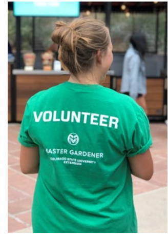
CMG volunteer at a local event.