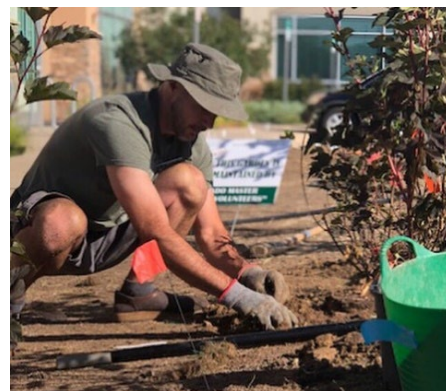
Arapahoe County CMG volunteering at the Native Plants Pollinator Demo Garden.

To be acceptable for CMG hours, the demonstration garden must truly empower the viewer to make knowledgeable decisions. This requires signage and print materials about the garden's educational objectives. For example, an attractive xeric garden does not give viewers the knowledge to adapt xeric principles in their home gardens. Signs need to identify xeric plants the viewer may want to purchase. Onsite printed materials, online links and/or QR codes should give additional information about techniques for reducing water usage. CMG programs should also consider sponsoring public educational activities in the garden. It could also be used as a backdrop or tool for blogs, newspaper articles, and you-tube video production.