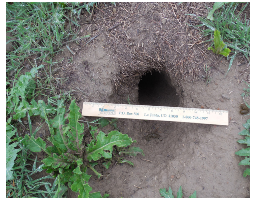
Figure 10: Prairie dog burrow

(solid tubes of soil) above ground when the snow melts in the spring, and suddenly wilting plants (due to root damage). If you walk across an area inhabited by pocket gophers, your foot will frequently break through into their tunnels. The tunnels are usually 2.0-3.5" in diameter, and are usually found in the top 4-18" of soil. The mounds pocket gophers create are fan-shaped to round and usually have closed entrances, unlike those of prairie dogs and Wyoming ground squirrels.