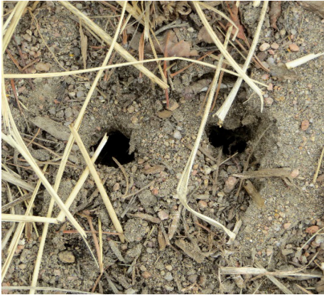
Figure 5 and 6: Examples of vole holes. They often burrow near a rock.