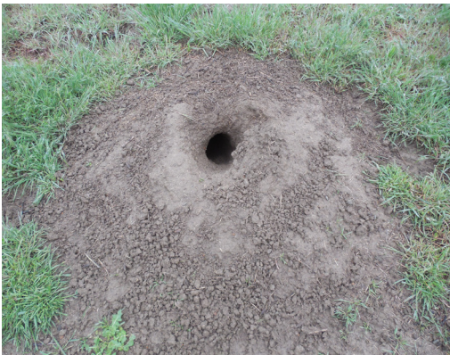
Figure 12: Prairie dog burrow and mound from the holes. Over time the prairie dogs build a mound around the holes. Mounds may be dome or crater shaped. They clip and consume the vegetation around the holes partly for forage and nesting material, but also to provide better predator detection. They will also dig holes to consume plant roots. They live in colonies so their damage extends beyond the single holes to cover the whole colony.

It is common to see prairie dogs when they are present, as they are active all year round, and are frequently above ground. Periods of prolonged rain or snow cause the prairie dogs to retreat to their burrows.