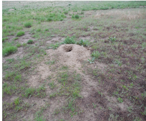
Figure 13: Weedy area around mound where previously existing vegetation was removed by the prairie dogs.

This species of ground squirrel was formerly known as Richardson's ground squirrel. Wyoming ground squirrels can be confused with prairie dogs, especially Gunnison's prairie dog. Wyoming ground squirrels usually live at higher elevations (6,000 – 12,000') than black-tailed prairie dogs (3,315 – 7,200). They are found primarily in central to northern Colorado, west of the Front Range. The Wyoming ground squirrel is diurnal, emerging from its burrow shortly after sunrise and returning before sunset. The ground squirrel lives in colonies but the individuals may not be related. Ground squirrels hibernate in the winter unlike black-tailed prairie dogs.