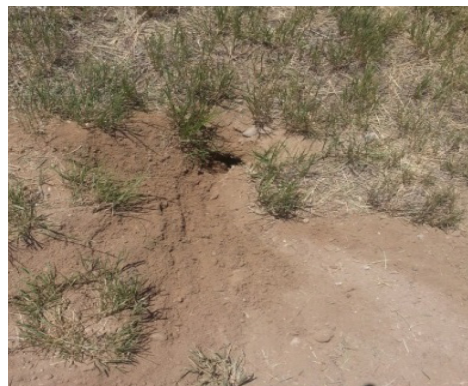
Figure 14: A newly formed Wyoming ground squirrel burrow and mound. Note the similar fanning to pocket gopher holes. Wyoming ground squirrel burrows remain open.