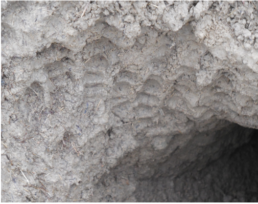
Figure 11: A crater mound formed in moist soil. Note the nose prints made in side of mound when the prairie dog compacted the soil.