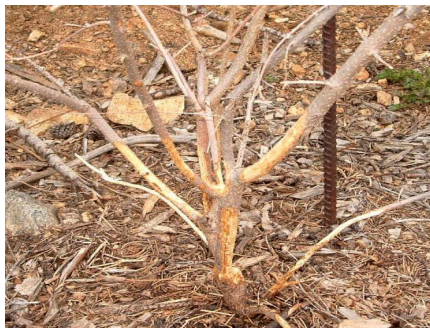
Figure 2: Vole damage on lilac. Notice small, irregular tooth marks, all under what was the snow line.

Vole damage to trees and shrubs is characterized by girdling and patches of irregular patterns of gnaw marks about 1/16 to 1/8-inch wide. Gnawed stems may have a pointed tip.