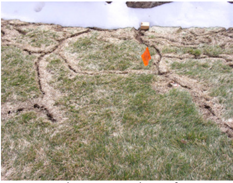
Figure 3: Vole runways in lawn after snow melt in spring.