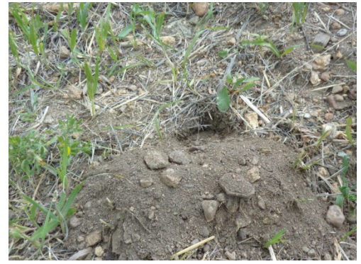
Figure 9: Fan-shaped mound with closed burrow is typical of pocket gophers.