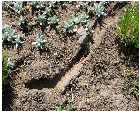
Figure 4: Vole burrow and runway in clay soil.